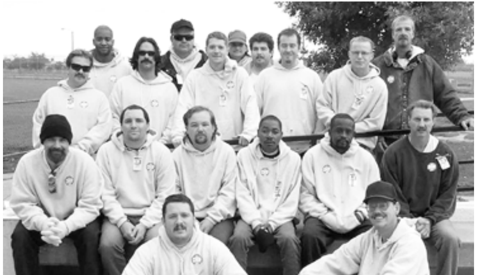
The inmates in Rockwell City who walked for the hungry.