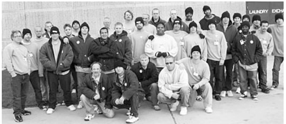
The Fort Dodge inmates who walked.