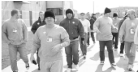
FDCF inmates stayed together in groups.