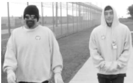
Cold or tired yet they still walk.